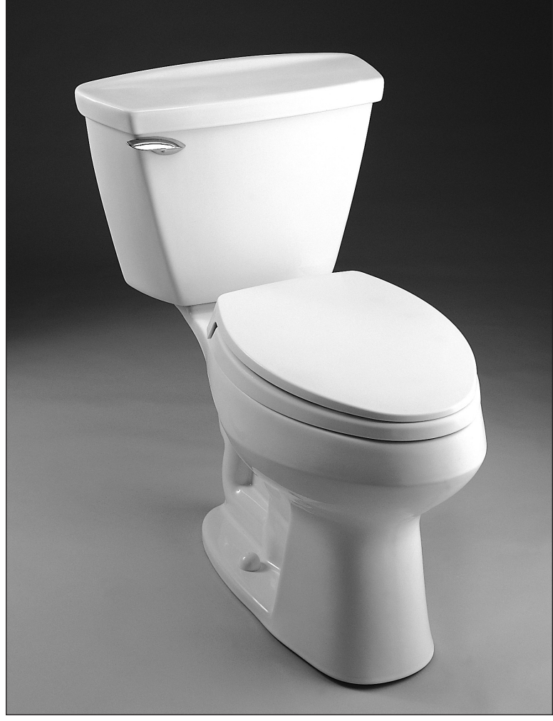
CST734F - Dalton Toilet SS114 - SoftClose Seat