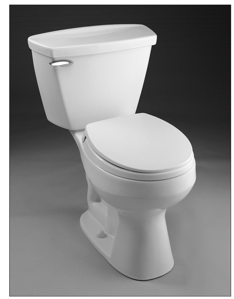
CST733F - Dalton Toilet SS113 - SoftClose Seat