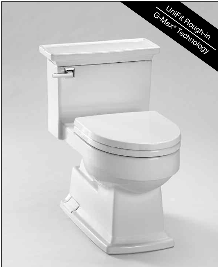
MS934214SF - Lloyd® Toilet