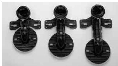
UniFit Rough-in: Easy to install 10", 12" and 14" rough-in's available.