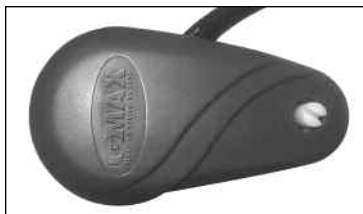
G-Max® Technology: Quiet, powerful, commercial grade flushing performance.