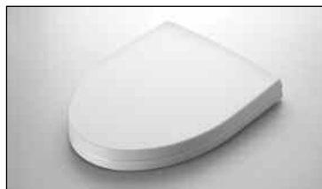
Complete with a Soirée® SoftClose® toilet seat, or upgrade to a Washlet®.