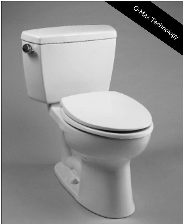
CST744S - Drake Toilet SS114 - SoftClose Seat