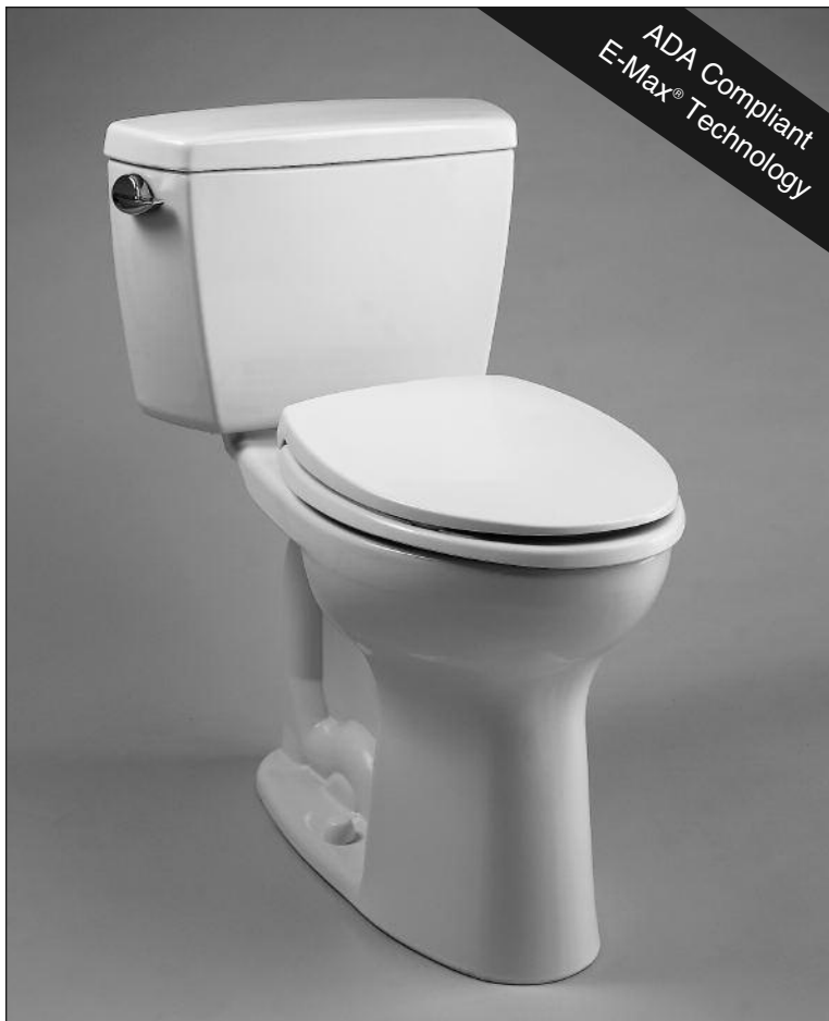
CST744EL - Eco Drake® Close Coupled Toilet with SS114 - SoftClose Seat