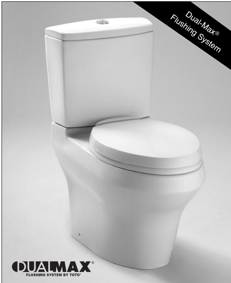
CST464MF - Aquia III Close Coupled Toilet with SS204 - SoftClose® Oval Seat