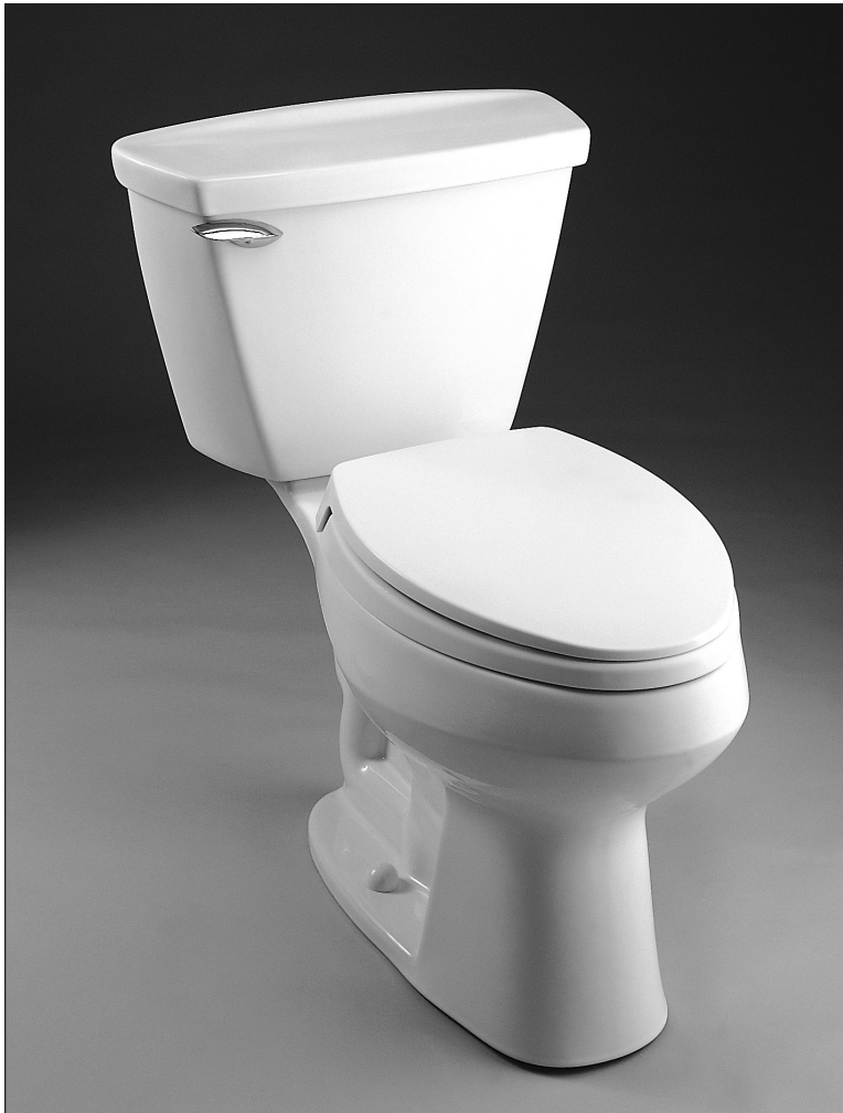
CST734F - Dalton Toilet SS114 - SoftClose Seat