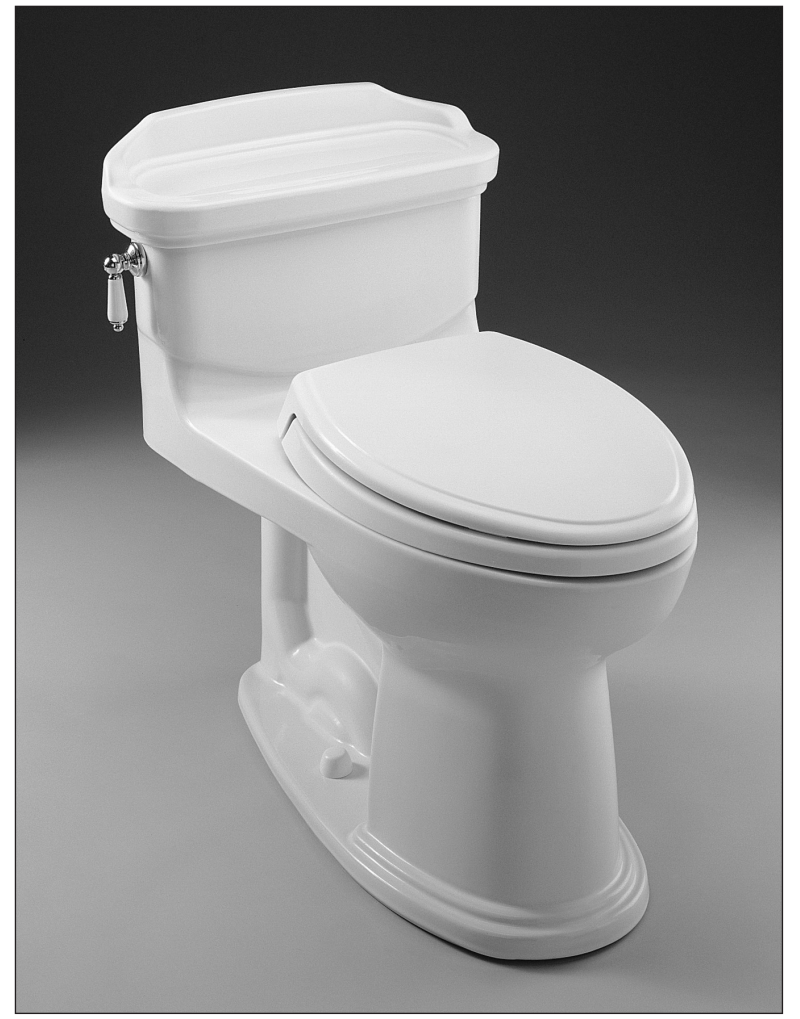
MS924154F - Plymouth Toilet with Traditional SoftClose Seat